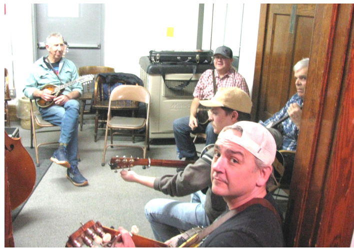
Furnace Room Jam