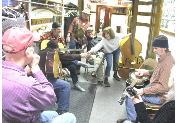
Coat Closet Jam