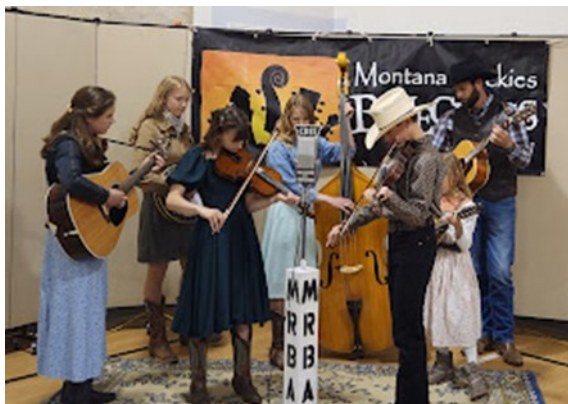
Jolley Family Band Fashion