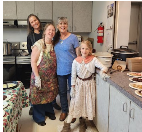
Kitchen Crew Fashion