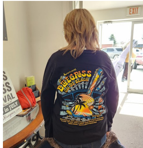
Bluegrass on the Beach Fashion