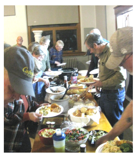
2024 at the Masonic Lodge