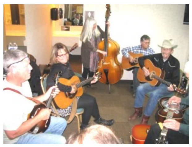
2016 at Ruby's