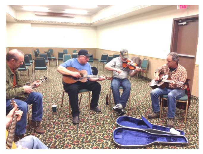
2013 at Ruby's

Believe it or not, we do not have any photos from the January/February winter jams to post for the newsletter. Instead, I thought you might enjoy some photos from winter jams in previous years.