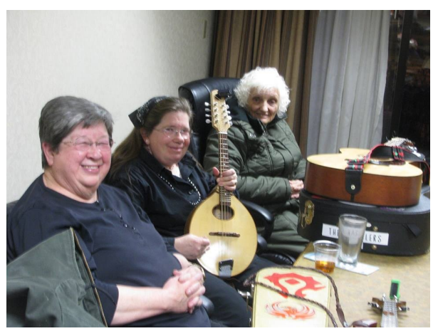
2018 at Ruby's