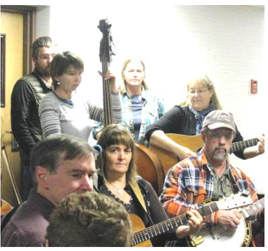
2015 at Ruby's