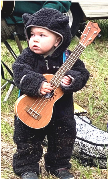
Oh no! A Guitar-Playing Bear Invaded the Jam!