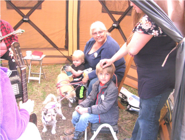
Puppies and Children Enjoying the Campout