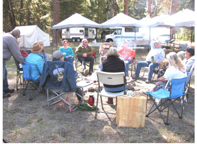
Time for Campfire Tales