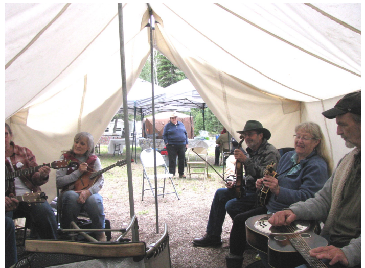
On the Outside Looking In