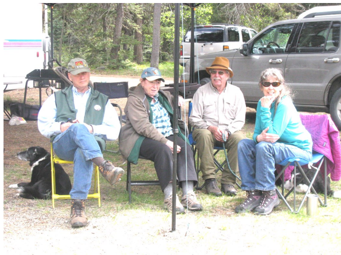
Bluegrass Philosophy Club