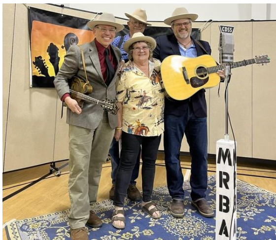
Love the matching hats! Love the music!