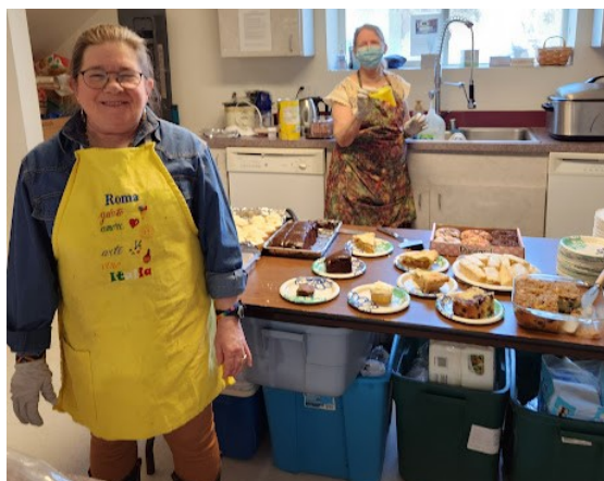
Thanks to the kitchen crew for good eats! (The apple pie was to die for.)