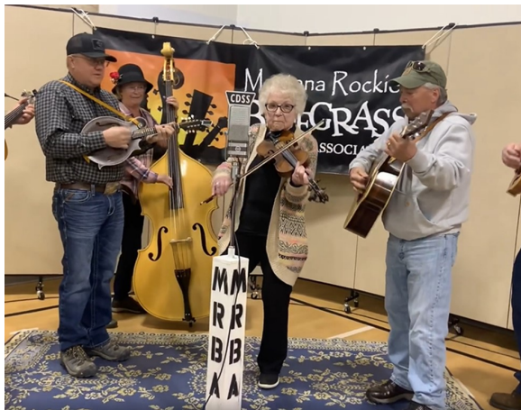
Ninety-three years old and still fiddling around at bluegrass festivals!