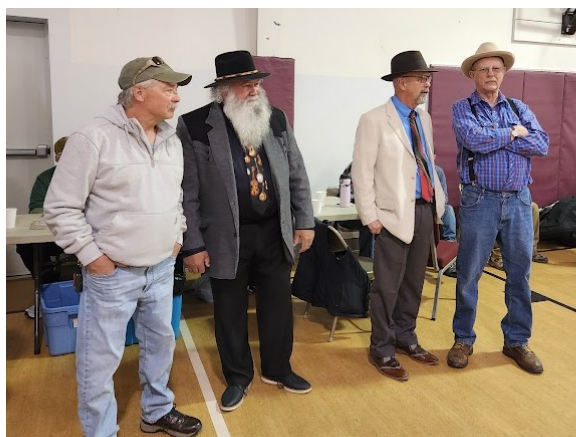
Bluegrass Fashion Show