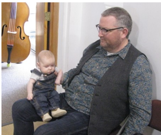
Three months old and already been to four bluegrass festivals!