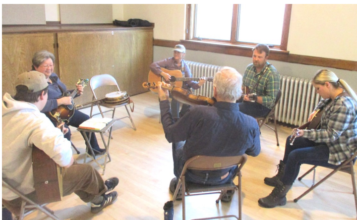
Old-Timers and Newcomers Jamming Together