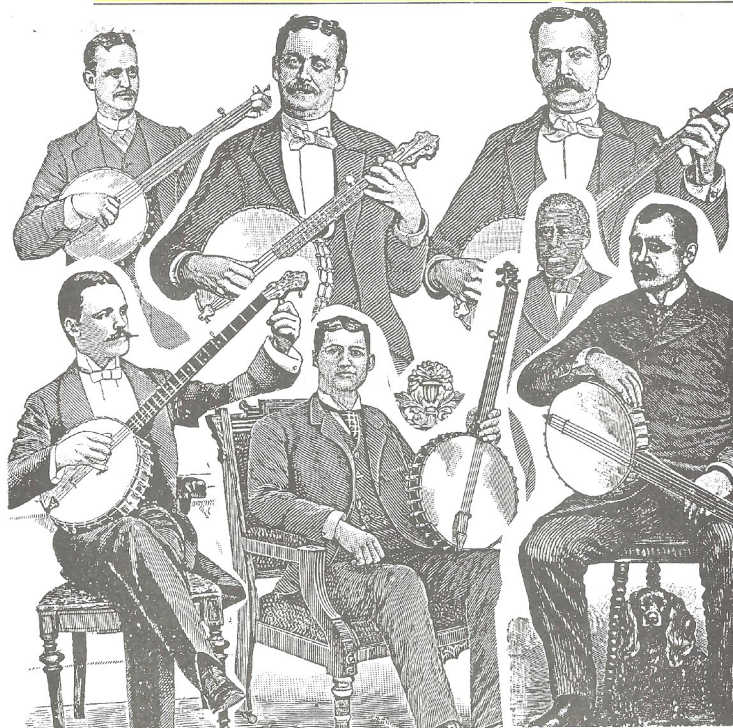
Cool cover art from an old edition of the Bluegrass Newsletter (1994)

Under the moon the mountains lie sleeping Over the lake the stars shine They wonder if you and I will be keeping The magic and music, or leave them behind