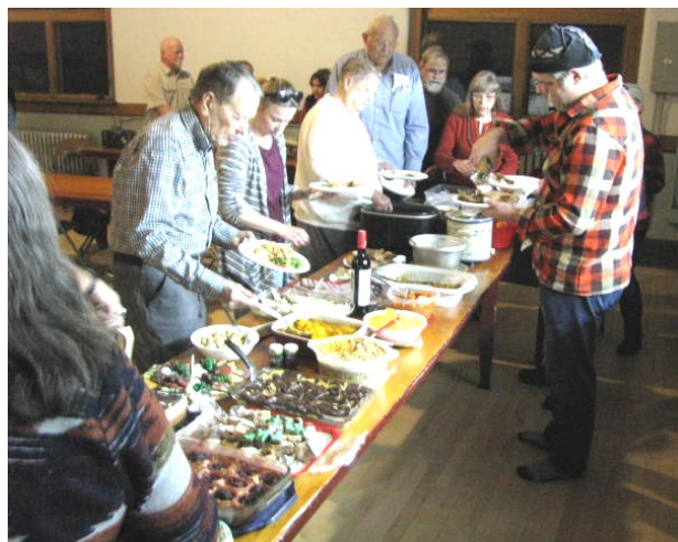
Best Potluck in Montana