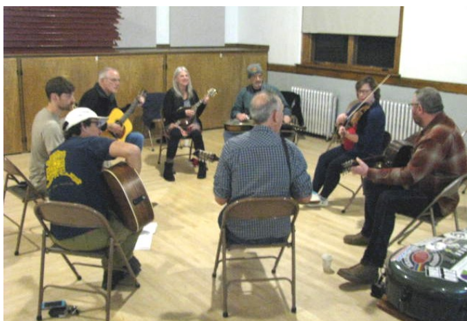
One Hot Jam Circle