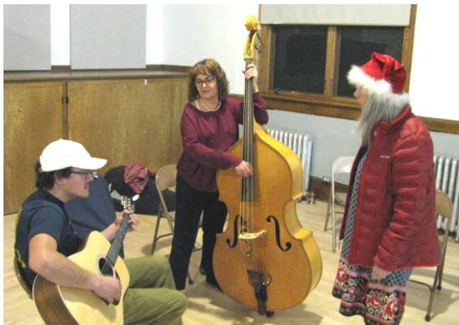
Tis the Season for Jammin'