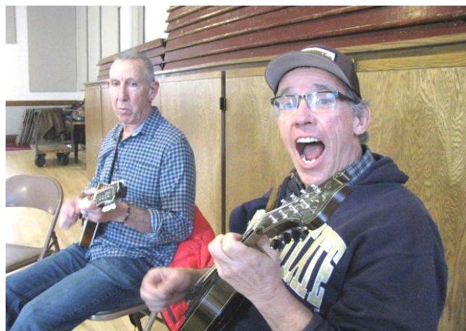
Someone is Having Too Much Fun