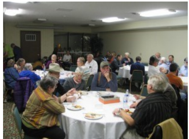
Lots of Grub & Great Friends!