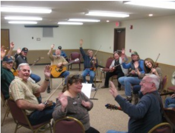
Happy Jammers at February Jam!