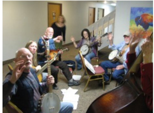
Howdy from the Jammers in the Hallway