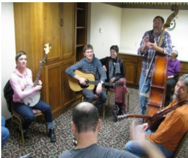
Pickin' & Grinnin' at the Winter Jam. Y'all come back now!