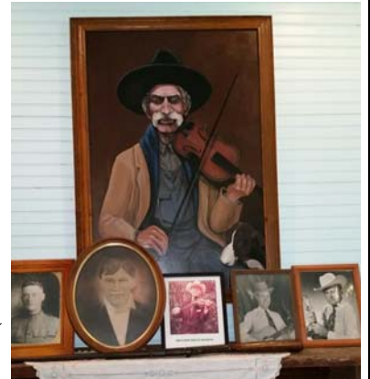
Painting of Uncle Pen

This past fall, I was at a business conference in Lexington, KY and decided as long as I was in the bluegrass state, I would rent a car and tour some famous landmarks in the history of bluegrass music. So the morning of September 17, I headed west on the “Bluegrass Parkway” towards Rosine, KY, the birthplace of Bill Monroe. Rosine is a small unincorporated community of just 41 people but it plays a larger than life part in bluegrass lore. Every where you turn, some place or sign evokes a bluegrass song. The Old Home Place of Bill Monroe is situated on Jerusalem Ridge. Uncle Pen’s cabin is just a mile outside of Rosine. Bill, the youngest of eight children, was a young boy when his mother died and upon losing his father when he was a teenager, he went to live with his Uncle Pen. Uncle Pen was a fiddler and was one of Bill’s earliest musical influence.