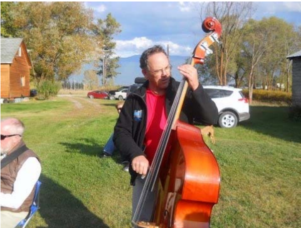
Who doesn't love that bass beat