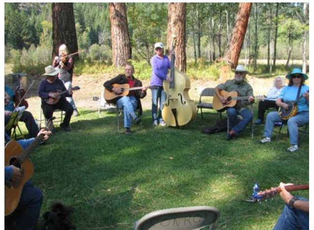
Beautiful Day for Jammin