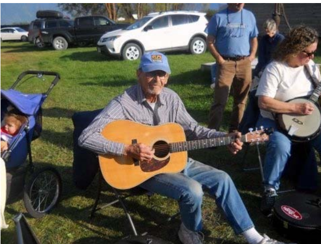
Jammin with Forrest