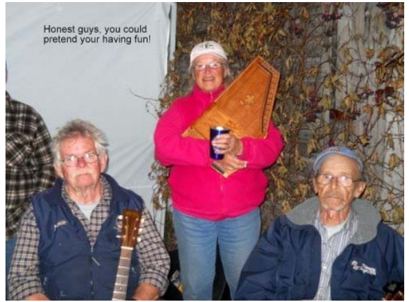
Having fun with the autoharp