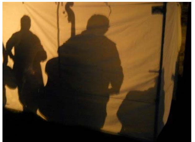
Shadows of bluegrass