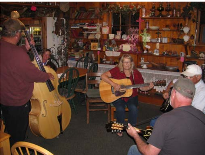
Late night jammin at the Broken Arrow