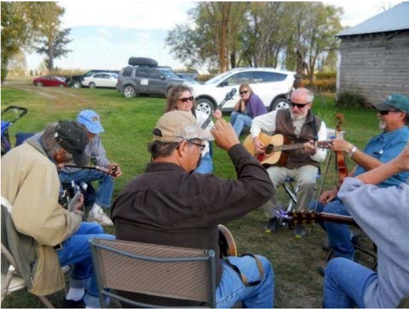
Beautiful fall day for a jam circle