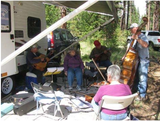
Lots of jammin - lots of good music.

Great weekend. Perfect size. (100 people) Lots of jamming, eatin, great pot lucks, talkin with friends.