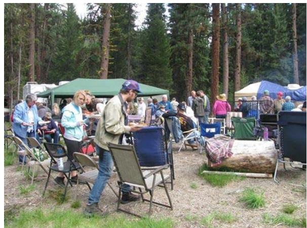
Let's get the chairs set up for some eating.