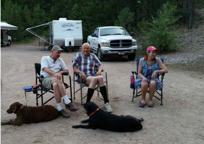
Dog Day Afternoon