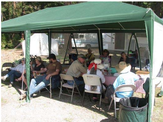
It almost got darned hot at a Memorial Day Camp-out!