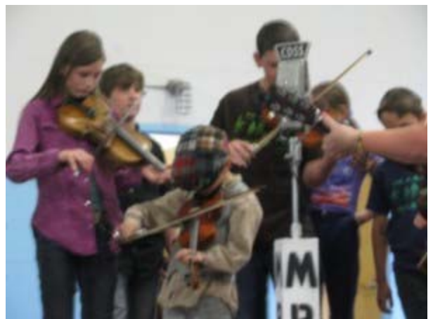
Great seeing our youth in Bluegrass!