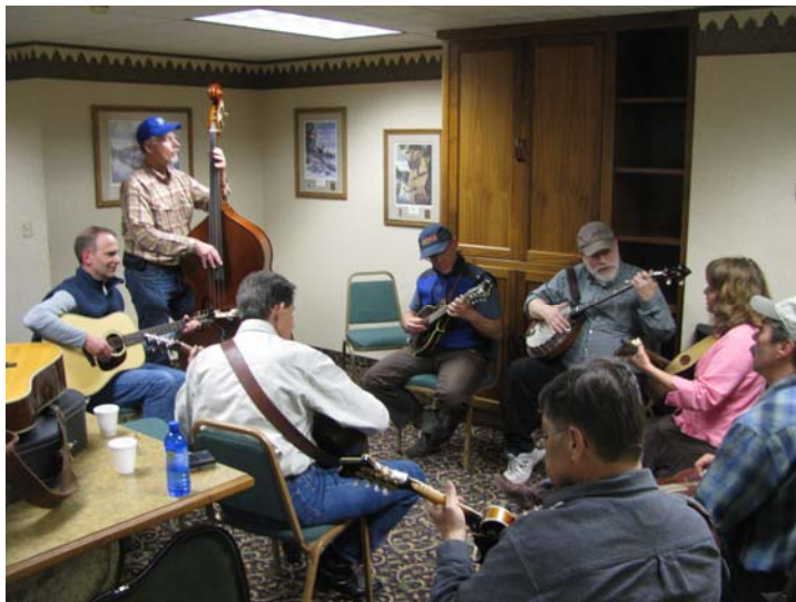
March Jam at Rubys—Big & Fun!

In the hall jammin— You can get through but you got to sing a song.