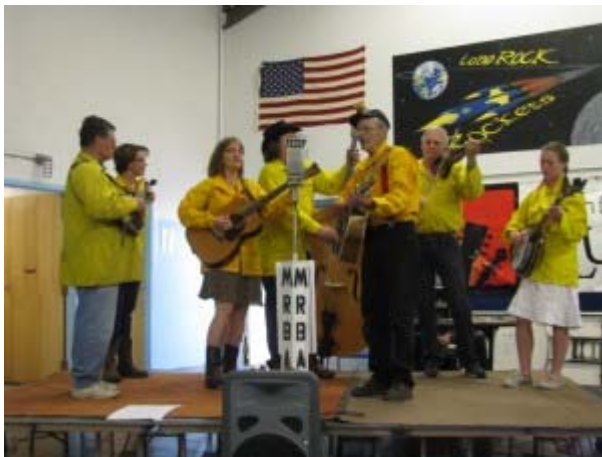
Fire on the Mtn playin some HOT music. (Forrest and the fire crew)