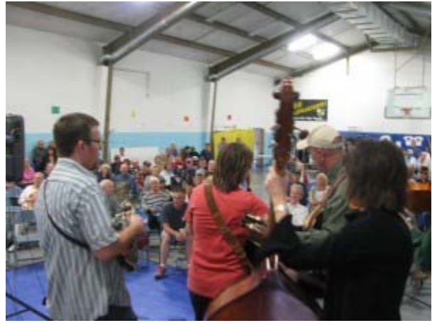
New South Fork—Playing it hot!