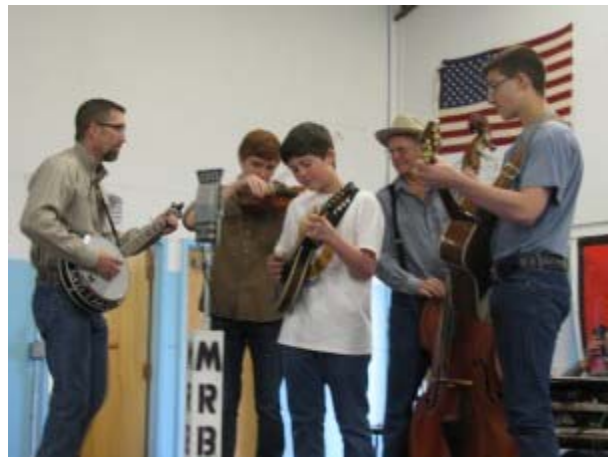
The Holtzen Family Families that play together—(you know the rest)