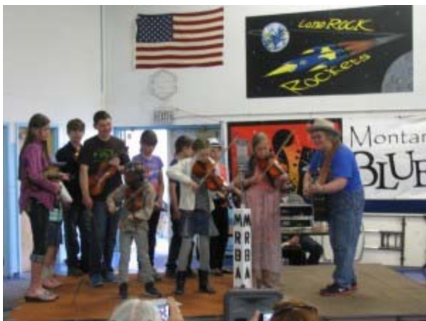
Kids in Bluegrass