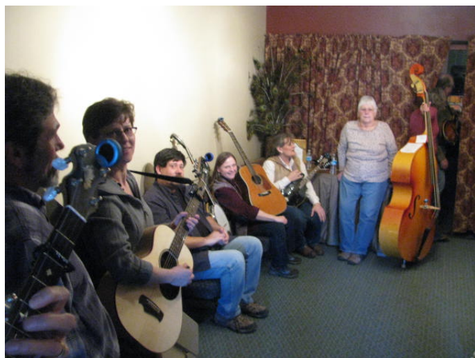
Practicing in the lobby