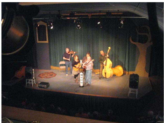
Nothing like being on stage.