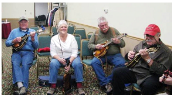
That's not the way we play it in Idaho.