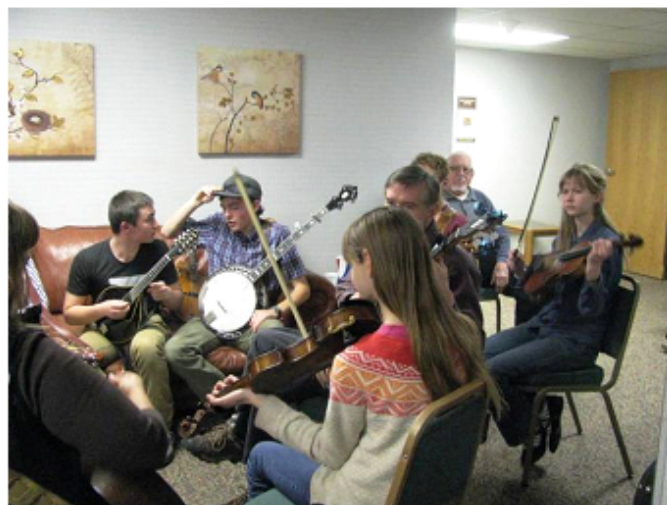
Teenagers playing bluegrass-Now we're talking!