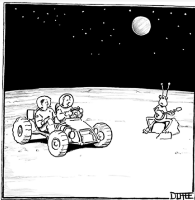
"So much for finding intelligent life."