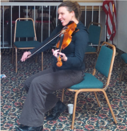
Fun with fiddlin!