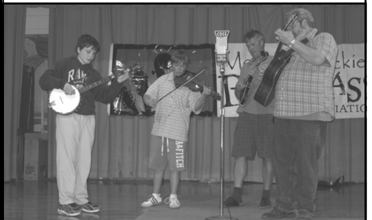
Uncle Bacca Juice