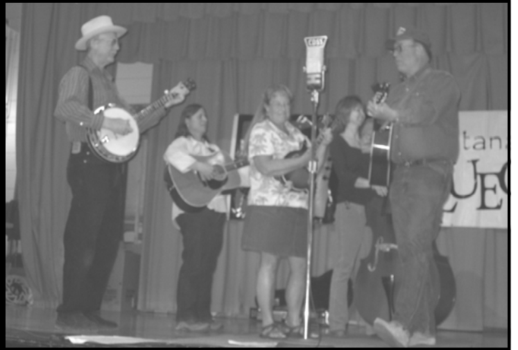
Salmon Valley Stringband