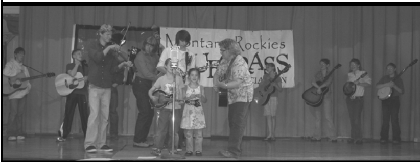
Kids in Bluegrass

Here are photos of all the groups who played at the festival in the order they appeared.