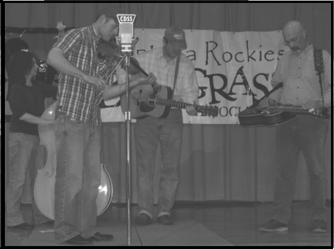
Chester Rudyard & Mullan Road