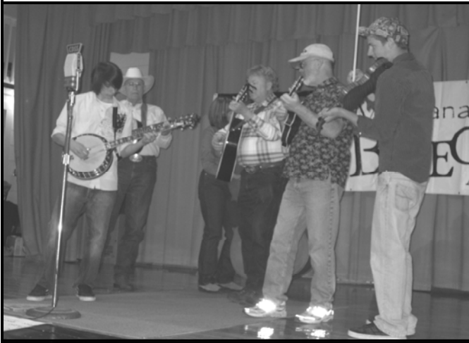
Black Mountain Boys