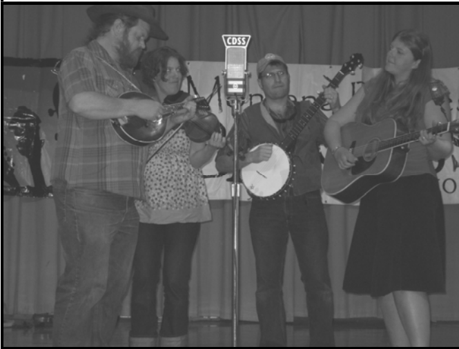
Wise River Merchantile