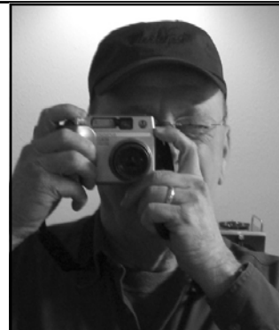
The new newsletter editor hard at work