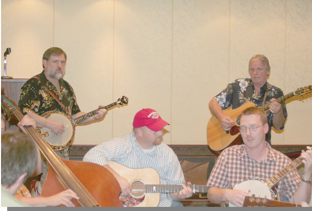
Jamming on the boat: a rare scene indeed!

Cost of the cruise was about $1,200 per person plus the miscellaneous expenses during the trip and the plane fare to get there. Two people can plan on dropping about $4,000 to $4,500 when it's all said and done.