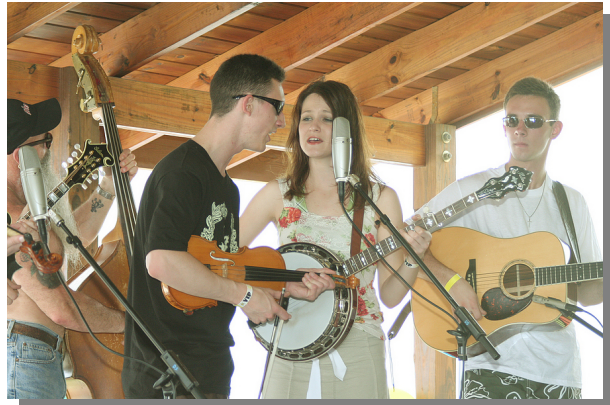
Cherryholmes goes casual when they're south of the border!

was nice....very nice rooms, etc. We stopped at San Juan, The Virgin Islands, The Dominican Republic, and The Grand Turks. It was nice being on warm sunny beaches in February!