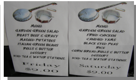
What Southern Bluegrassers eat