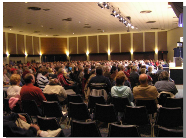
The large crowd was incredibly well-behaved