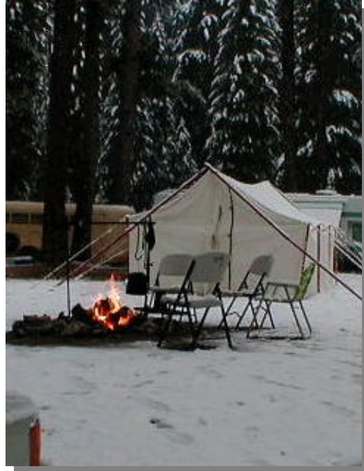
Wintry wall tent