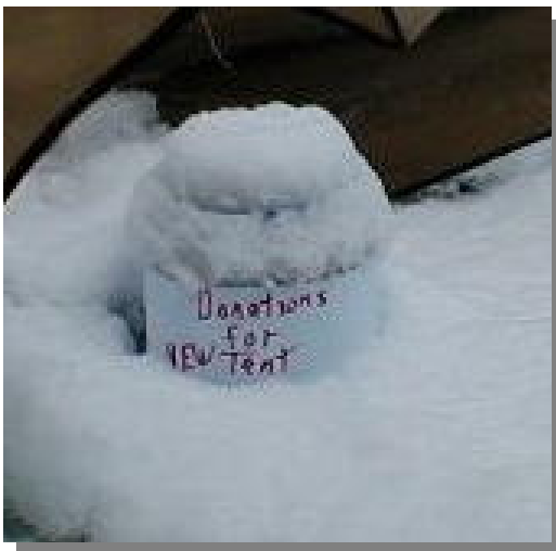
Donation jar and proof that tents are needed!