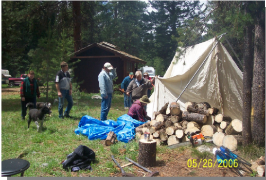
West Fork Log Splitters

We have set up the address label on your newsletter to be your membership card, please clip it out and use it for proof of your membership to the MRBA.