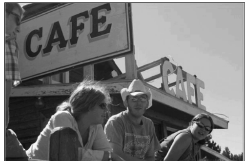
▲ Members of Broken Valley Roadshow digest a big breakfast feast after playing BabbFest.