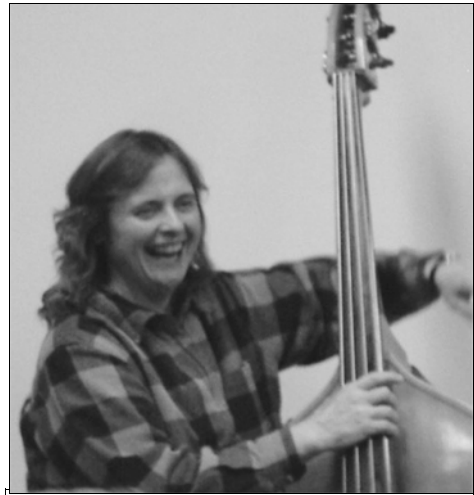
Heck, anyone can hold one of these things .