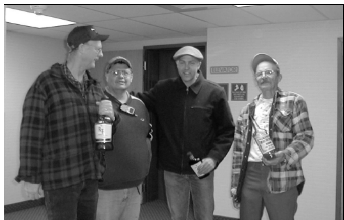
Four of the last five standing at 3 a.m. , (and proud of it!)