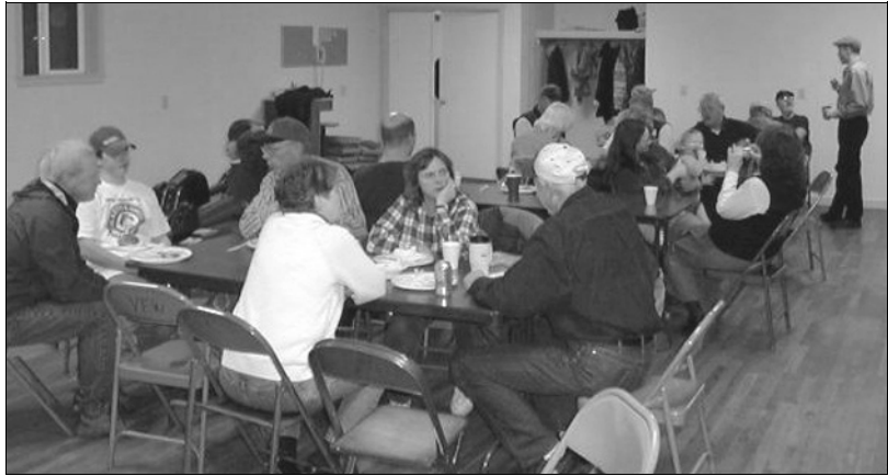
Full bellies....lots to talk over.

*sorry we didn't get any pictures of the downstairs jam!