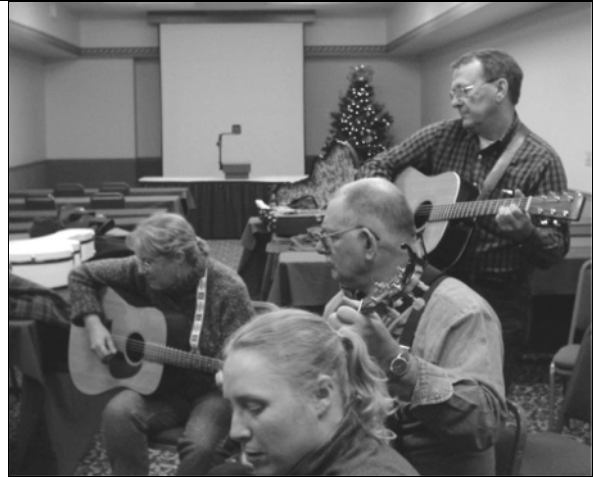
Hey, is that a bug on the floor?