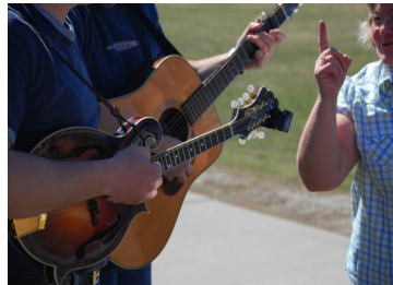
A one and a two, you know what to do...