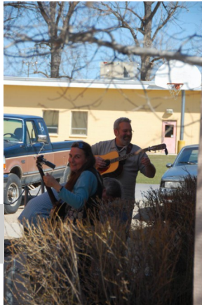
The Wheelrights warm up in the sunshine