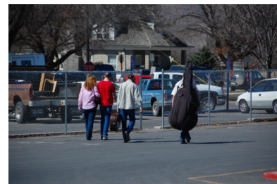
See you next year!!!