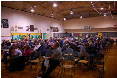
Pickers and Grinners enjoying the performances