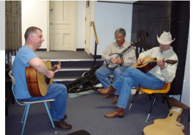
Bill & Ted & Larry's Excellent Adventure