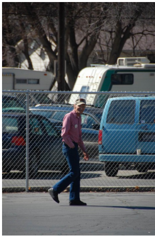
Forrest sneaks off!