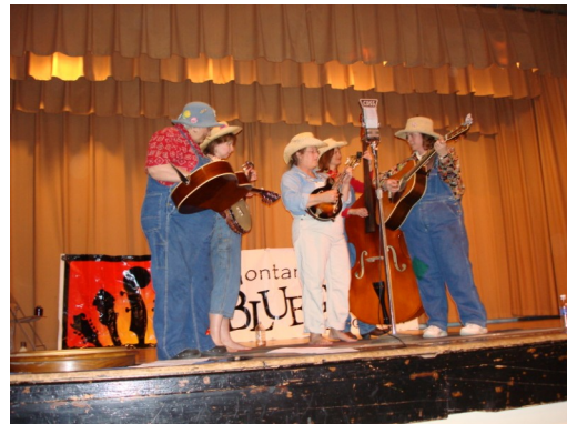
The Darby Sireens!