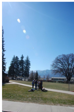
Who could ask for a more beautiful place to pick?