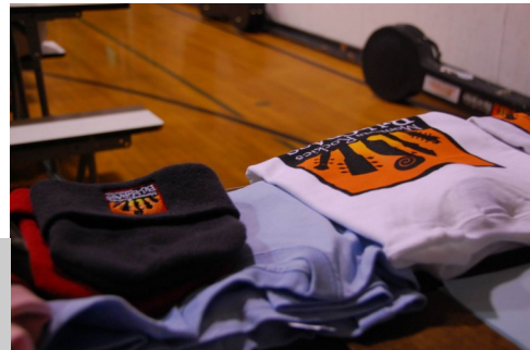
Brand new MRBA merchandise debuted at the Stevensville festival!