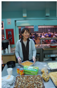
The food was especially good this year!