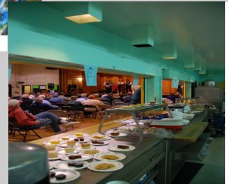
More photos on page 5...