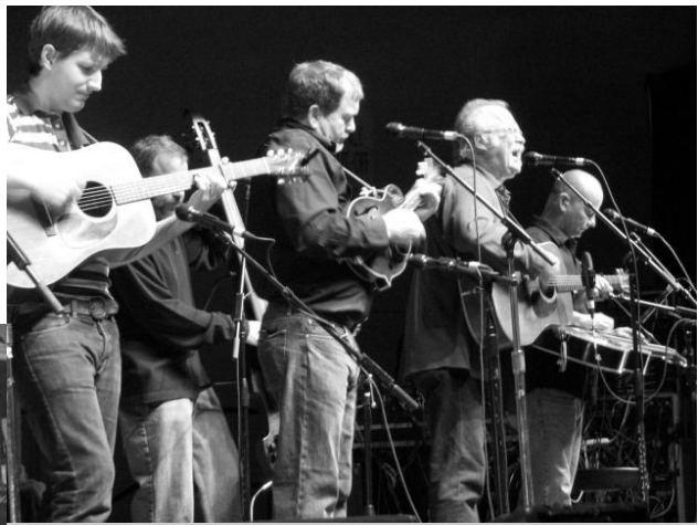
The Seldom Scene at the Portland Festival

and The Sceldom Scene. The list goes on and on. They had a great line-up. We had a lot of fun and are thankful we had the opportunity to attend the festival